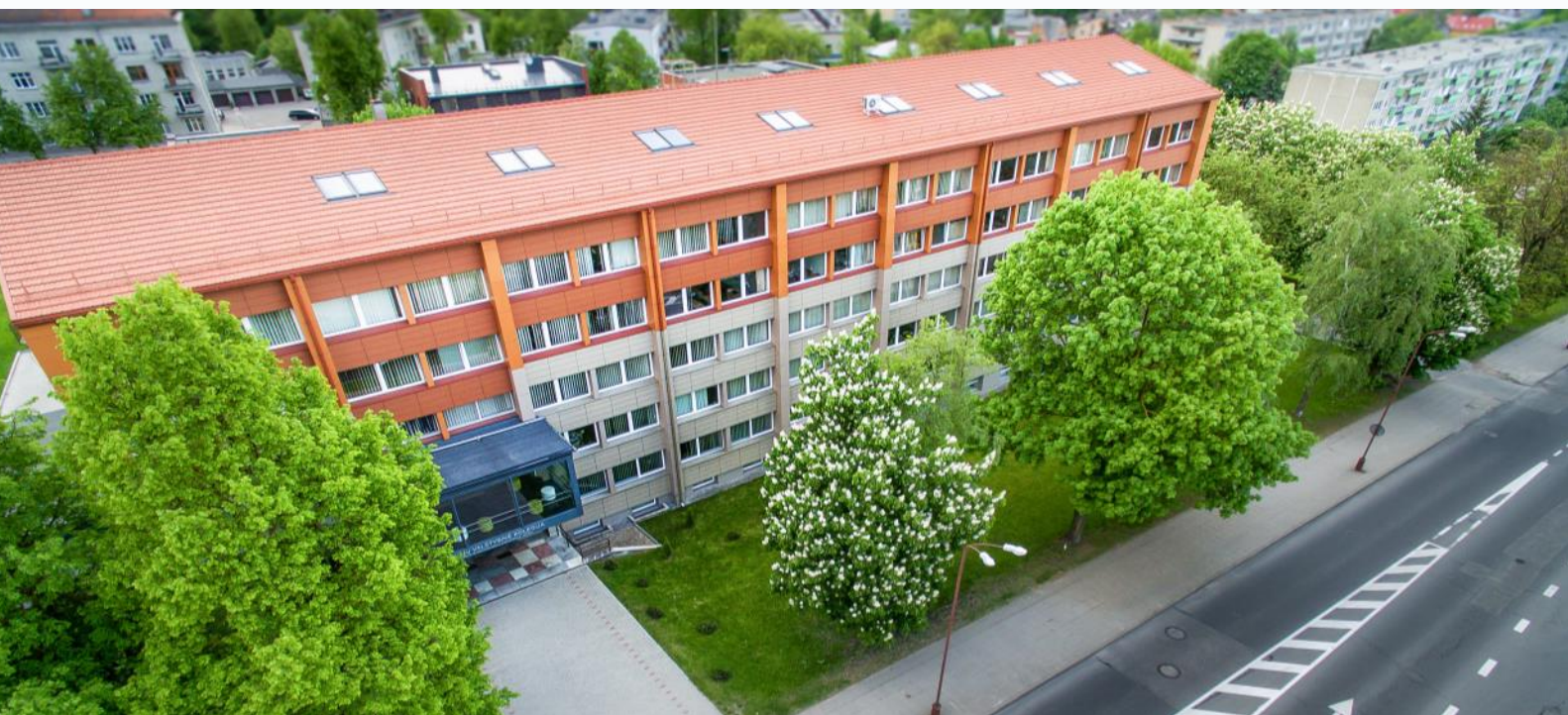
Faculty of Business and Technologies.

I building, address: Aušros av. 40, 76241