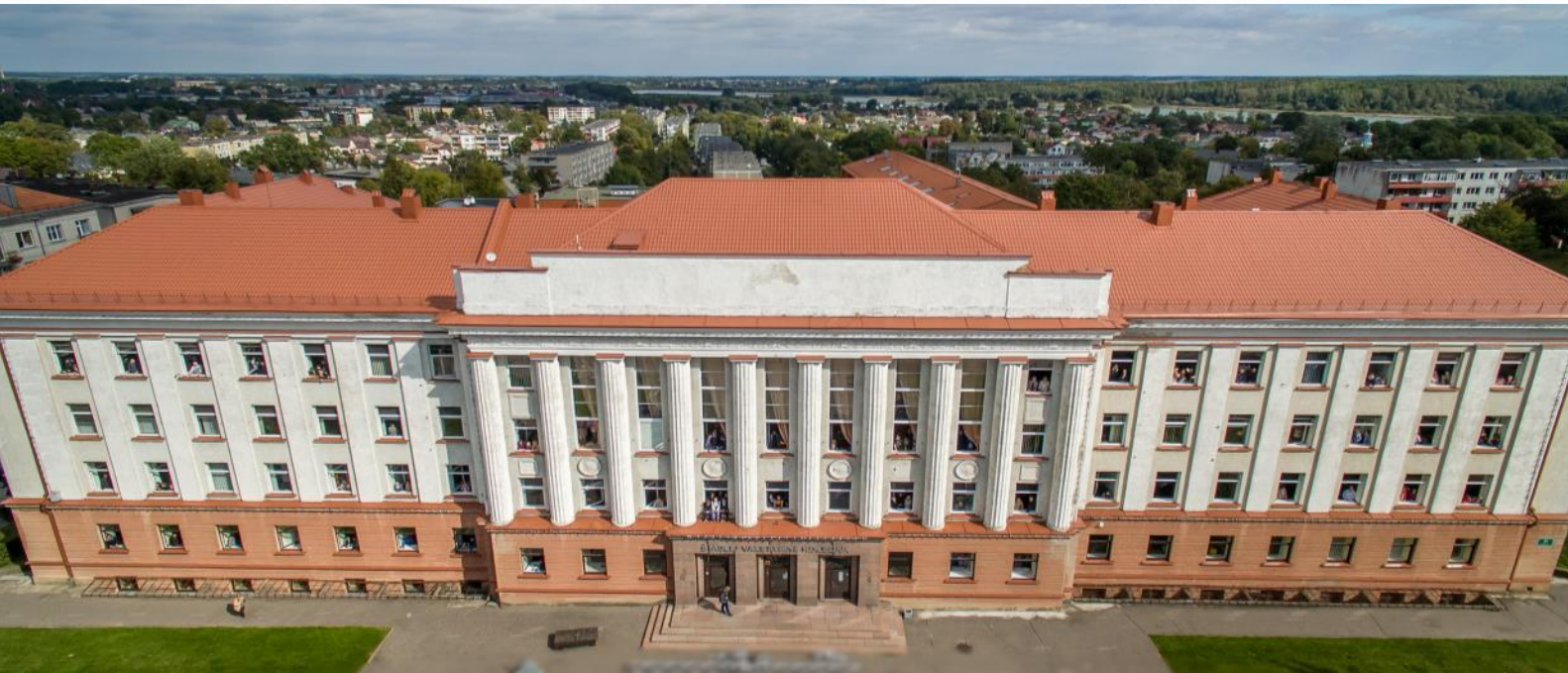
Central Building. Address: Aušros av. 40, 76241.