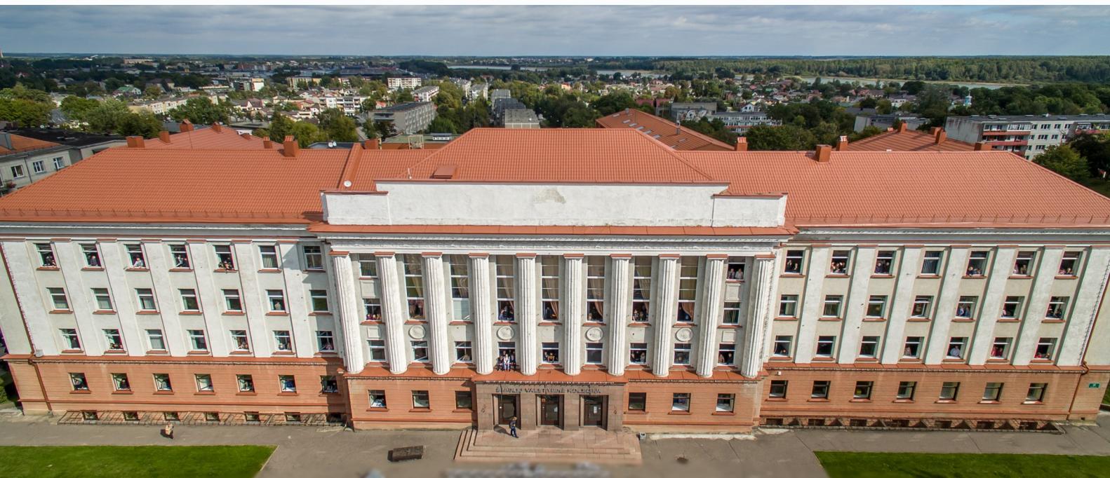
Central Building. Address: Aušros av. 40, 76241.