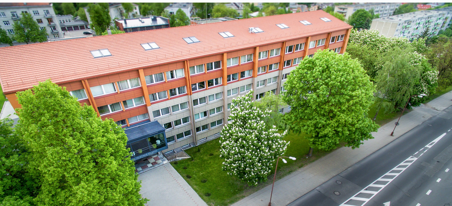
Faculty of Business and Technologies.

I building, address: Aušros av. 40, 76241